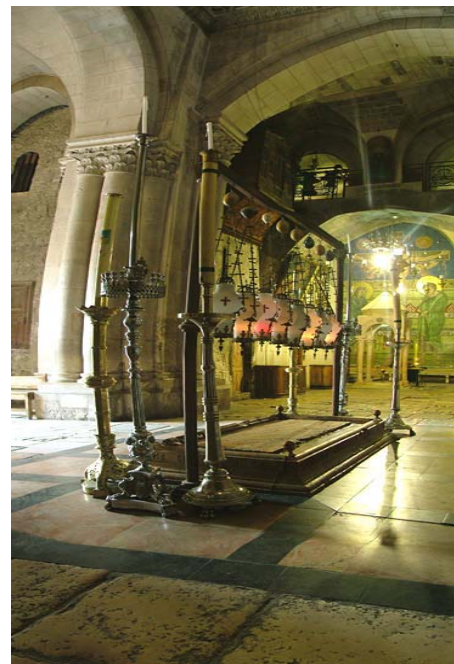
Rome Extension: Sept. 13 - 17

Let us rejoice in the Resurrection as we walk in the footsteps of Jesus throughout the Holy Land. This pilgrimage takes us to the major pilgrimage sites in the Holy Land where we will celebrate the great mysteries of His life: the nativity in Bethlehem; his simple life in Nazareth; the miracles of the loaves and fishes at Tabgha and the changing of water to wine at Cana; the Transfiguration at Mt. Tabor; the Last Supper; the Agony in the garden of Gethsemane; and, finally, his passion and death on the Via Dolorosa and at the Church of the Holy Sepulchre.