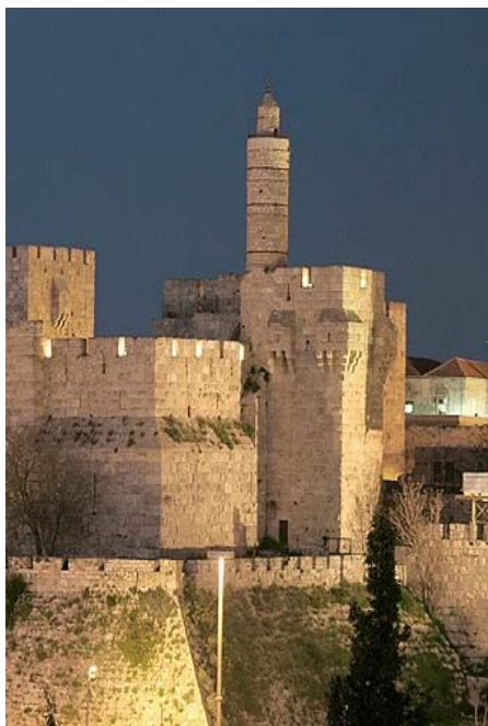
Holy Land / Sept. 5 - 14, 2011

TIBERIAS / MT. TABOR / JERUSALEM / CANA / GALILEE / BETHLEHEM / NAZARETH / ROME